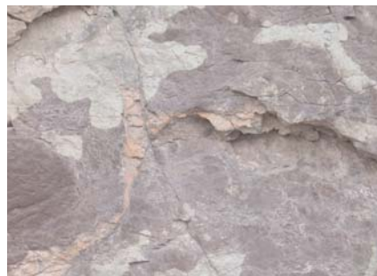
Attempting to magnify inclusions. Was this erythrite, a pink cobalt mineral?