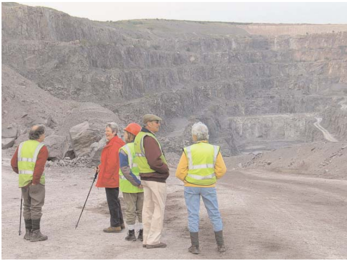
An awesome hole, now down to sea level; all dug in recent times!