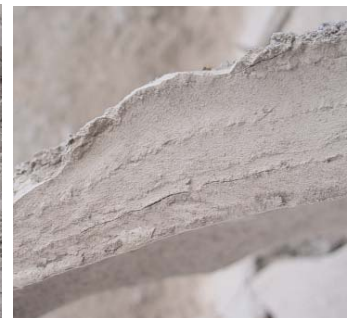
New clasts in the making, from above and in section!